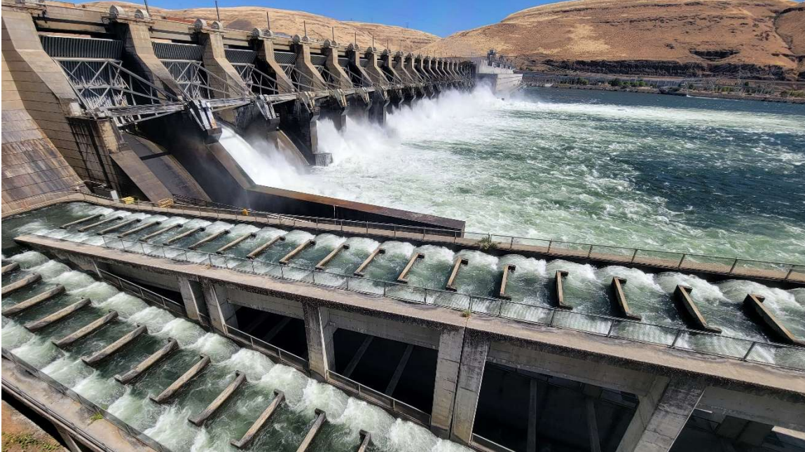
South View of John Day Dam

Bonneville Power Administration U.S. Bureau of Reclamation U.S. Army Corps of Engineers