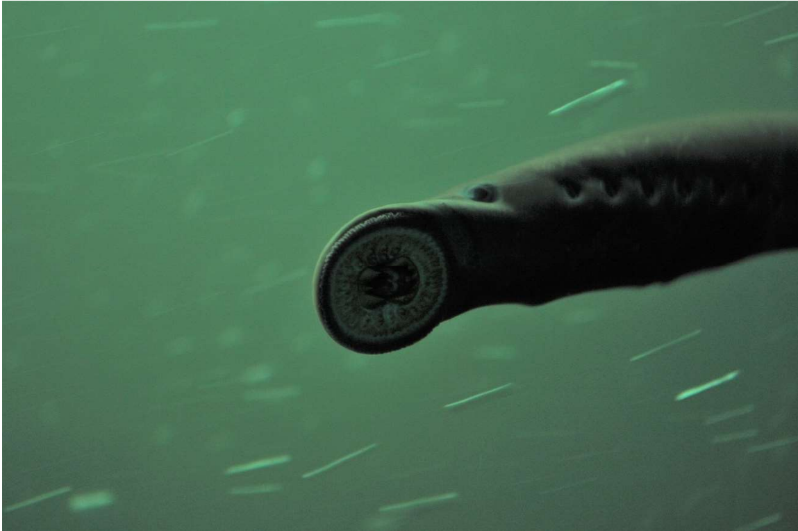
Lamprey at Bonneville Dam – Powerhouse Two – Fish Ladder September 2014

Bonneville Power Administration U.S. Bureau of Reclamation U.S. Army Corps of Engineers