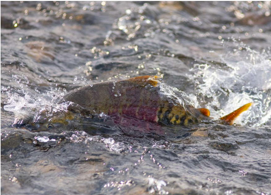
Chum Salmon at Ives Island November 21, 2022

Bonneville Power Administration U.S. Bureau of Reclamation U.S. Army Corps of Engineers