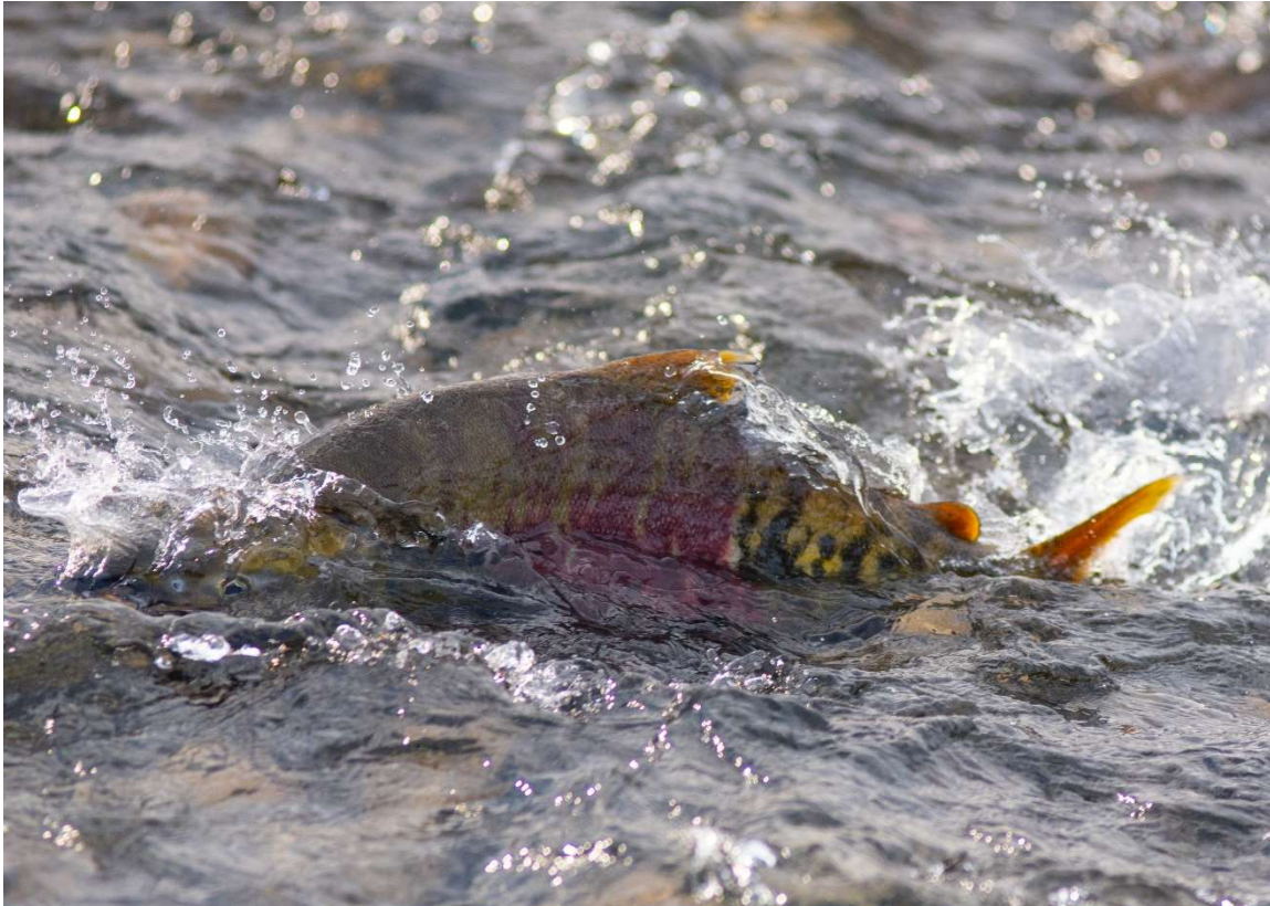
Chum Salmon at Ives Island November 21, 2022

Bonneville Power Administration U.S. Bureau of Reclamation U.S. Army Corps of Engineers