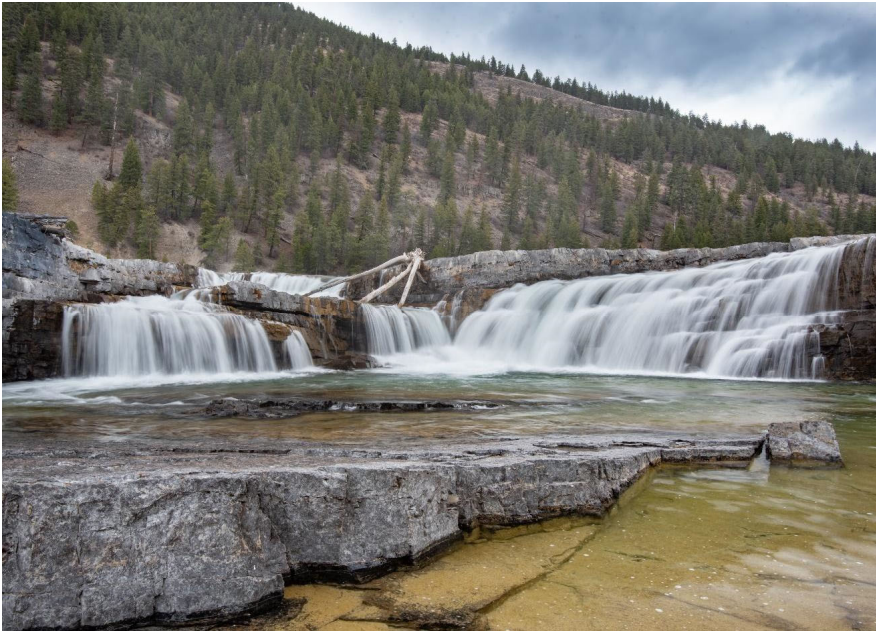
Kootenai Falls Date of Photo, March 29, 2021

▪ Bonneville Power Administration U.S. Bureau of Reclamation U.S. Army Corps of Engineers