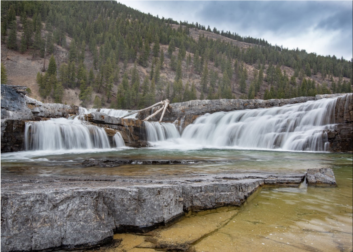
Kootenai Falls Date of Photo, March 29, 2021

Bonneville Power Administration U.S. Bureau of Reclamation U.S. Army Corps of Engineers