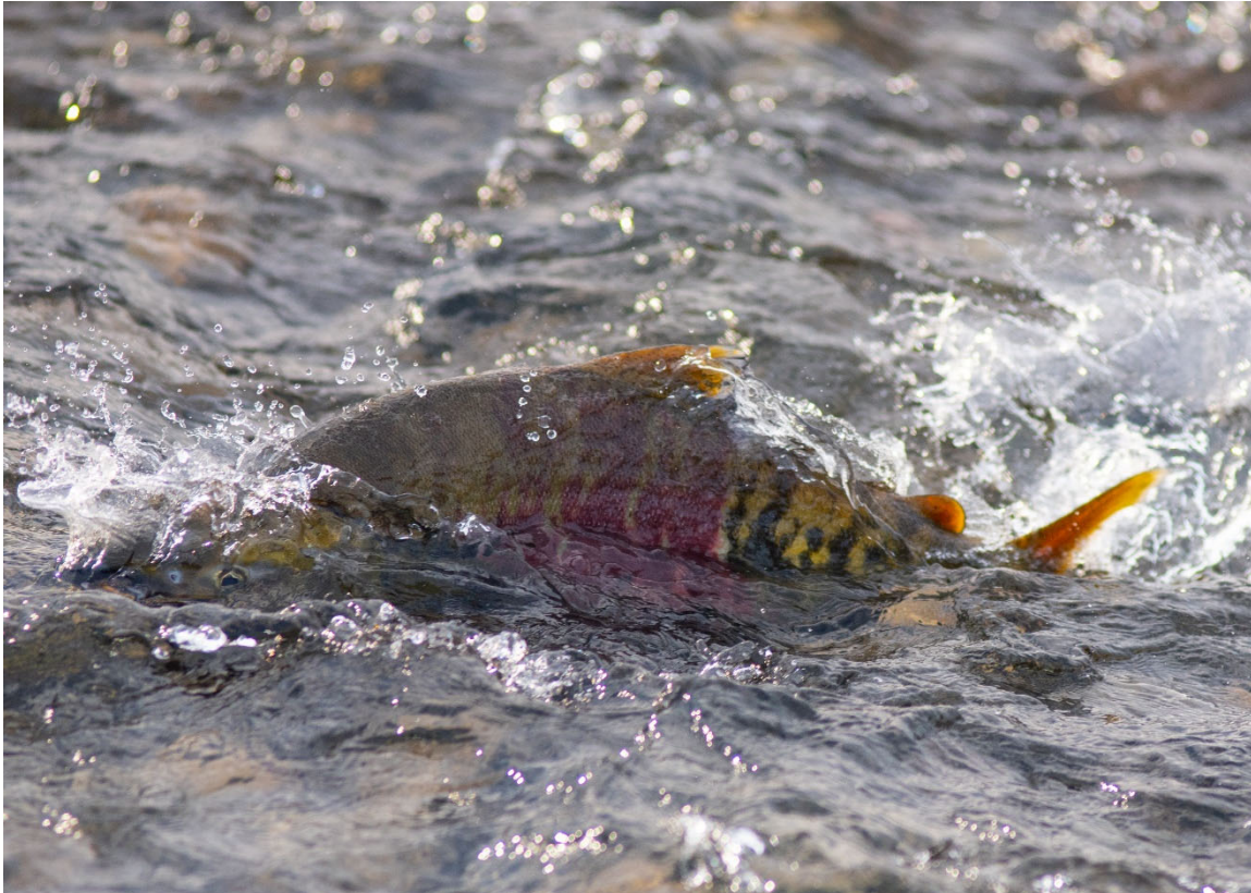
Chum Salmon at Ives Island November 21, 2022

Bonneville Power Administration U.S. Bureau of Reclamation U.S. Army Corps of Engineers