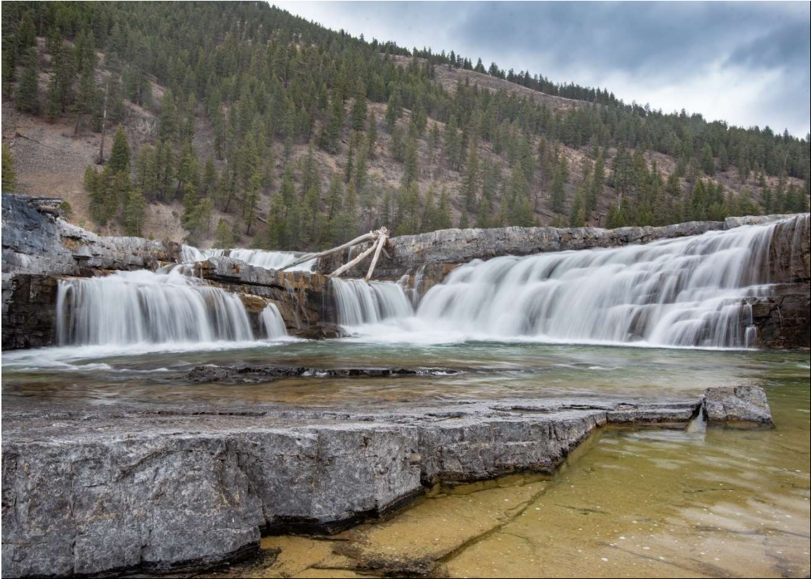
Kootenai Falls March 29, 2021

Bonneville Power Administration U.S. Bureau of Reclamation U.S. Army Corps of Engineers