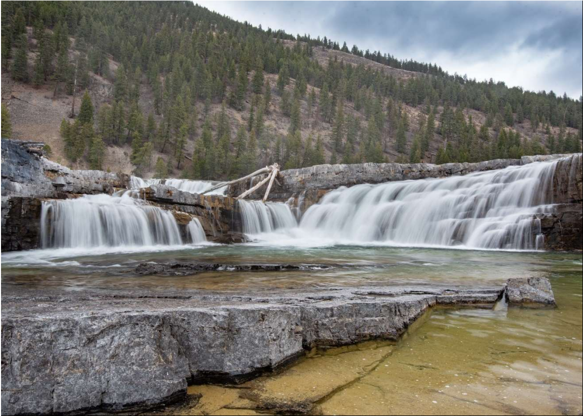
Kootenai Falls Date of Photo, March 29, 2021

Bonneville Power Administration U.S. Bureau of Reclamation U.S. Army Corps of Engineers