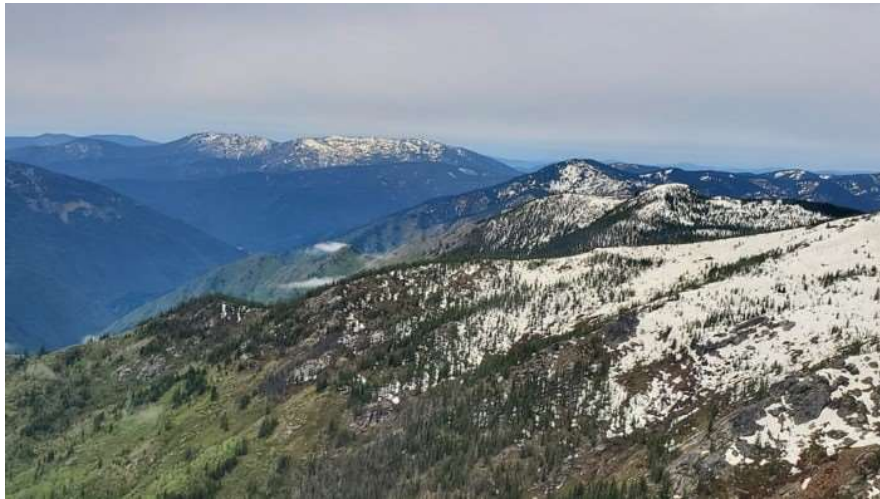
Dworshak Dam Snowline June 1st, 2020

Bonneville Power Administration U.S. Bureau of Reclamation U.S. Army Corps of Engineers