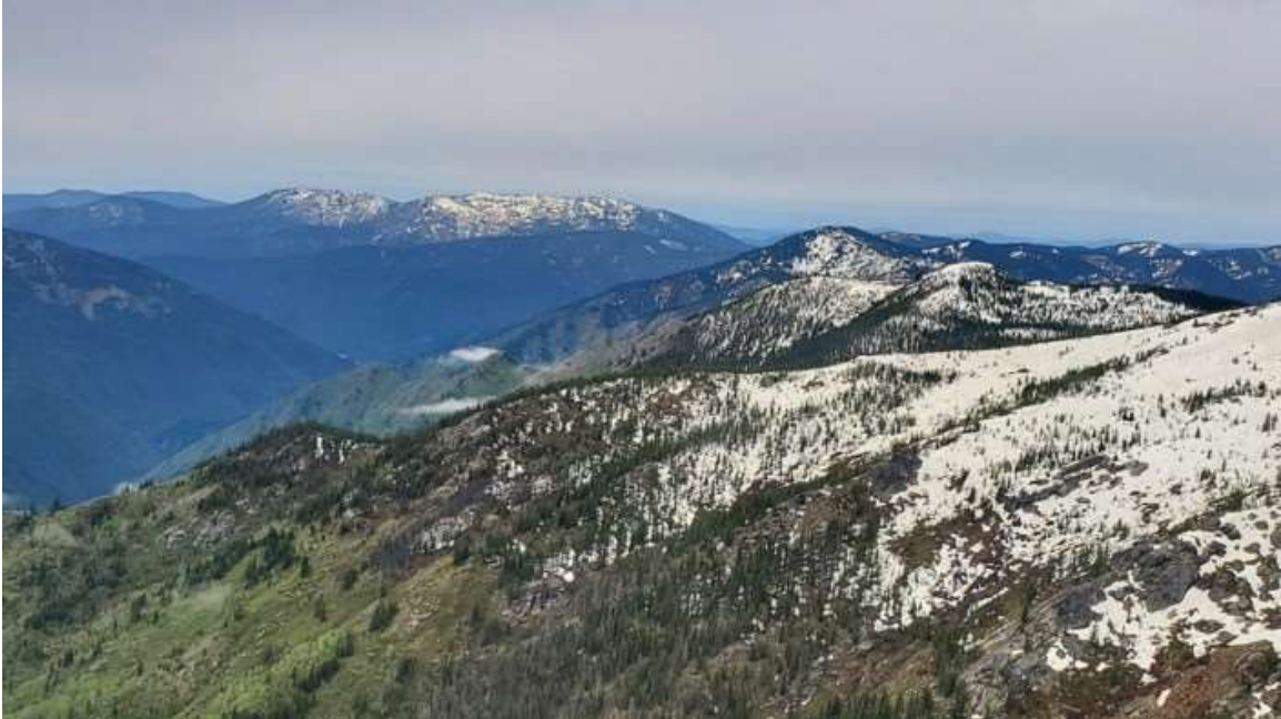
North Fork Clearwater Watershed Snowline June 1st, 2020

Bonneville Power Administration U.S. Bureau of Reclamation U.S. Army Corps of Engineers