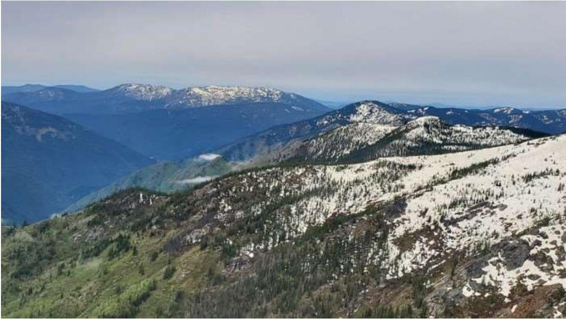
North Fork Clearwater Watershed Snowline June 1st, 2020

Bonneville Power Administration U.S. Bureau of Reclamation U.S. Army Corps of Engineers