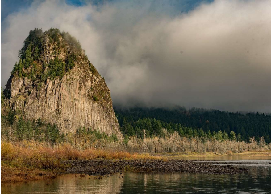
Beacon Rock Skamania, WA

Bonneville Power Administration U.S. Bureau of Reclamation U.S. Army Corps of Engineers