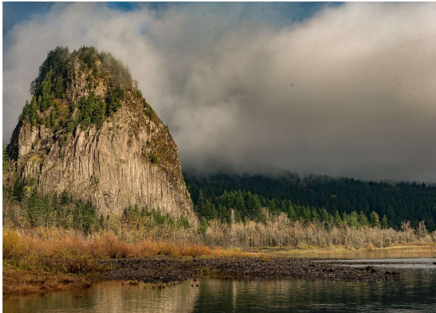
Beacon Rock Skamania, WA

Bonneville Power Administration U.S. Bureau of Reclamation U.S. Army Corps of Engineers