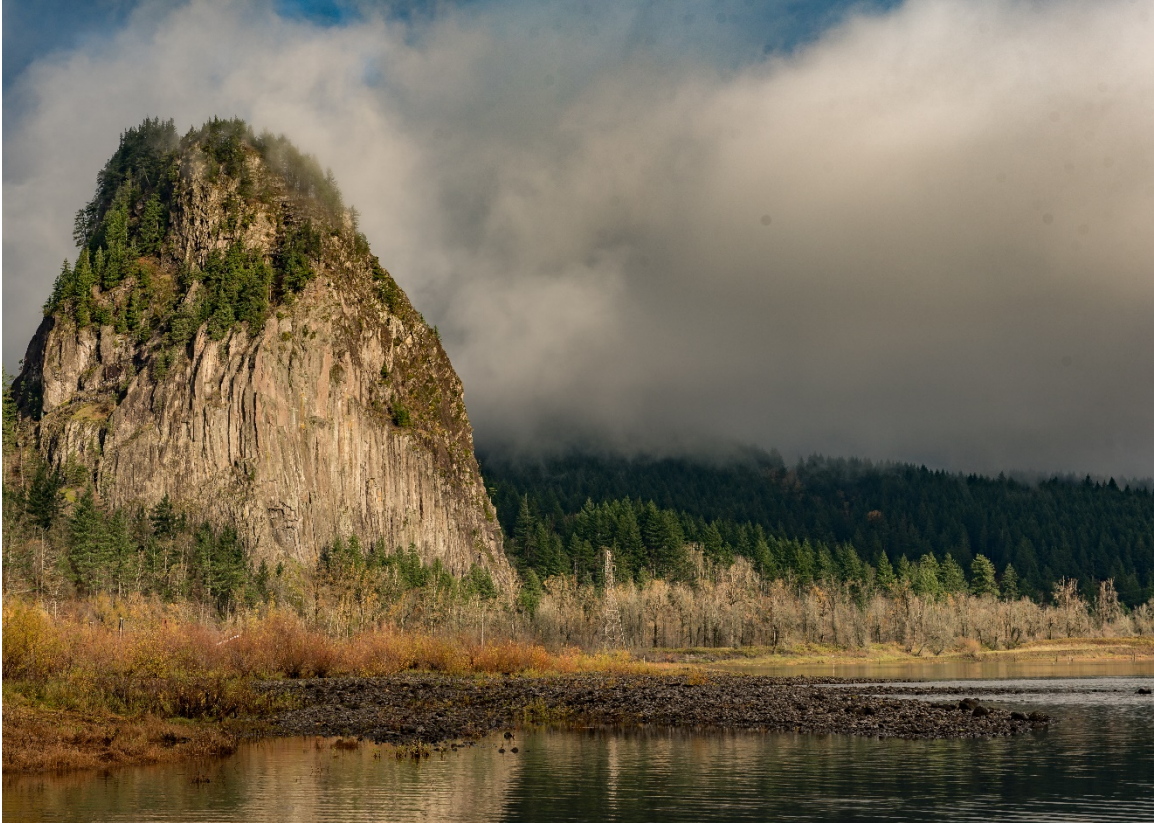
Beacon Rock Skamania, WA

Bonneville Power Administration U.S. Bureau of Reclamation U.S. Army Corps of Engineers