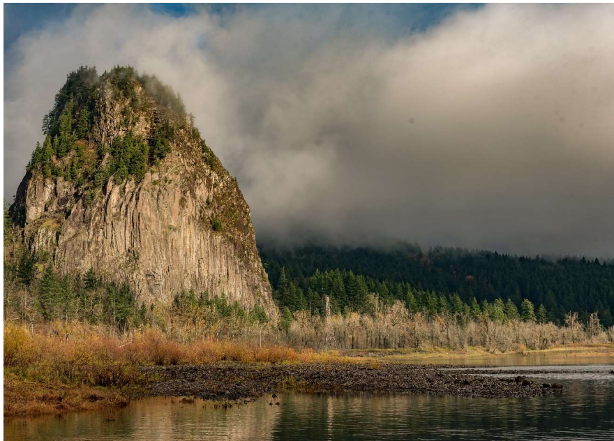
Beacon Rock Skamania, WA

Bonneville Power Administration U.S. Bureau of Reclamation U.S. Army Corps of Engineers