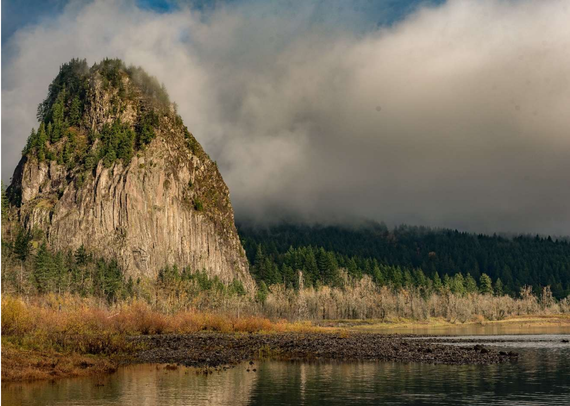
Beacon Rock Skamania, WA

Bonneville Power Administration U.S. Bureau of Reclamation U.S. Army Corps of Engineers