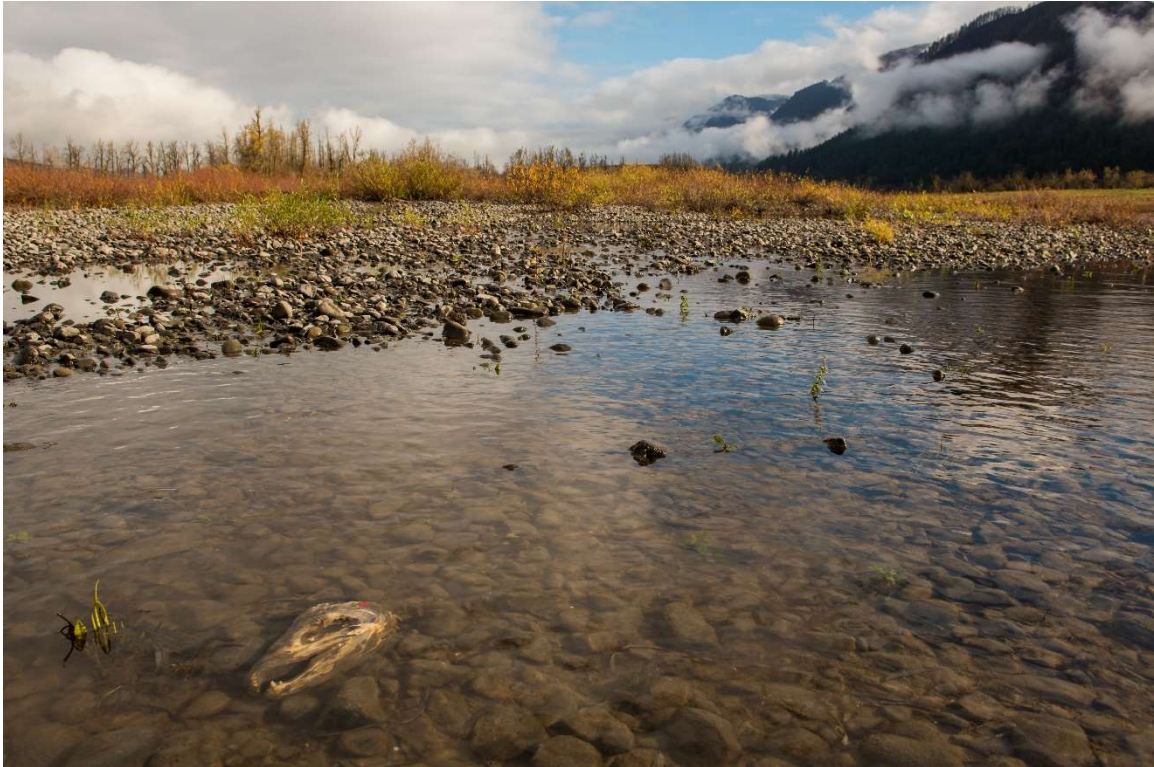
Ives Island Spawning Area Downstream of Bonneville Dam

Bonneville Power Administration U.S. Bureau of Reclamation U.S. Army Corps of Engineers