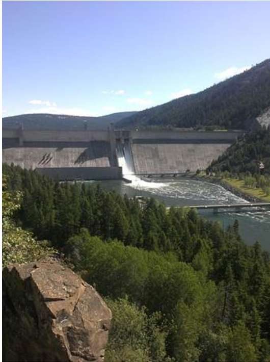
Libby Dam Libby, Montana

Bonneville Power Administration U.S. Bureau of Reclamation U.S. Army Corps of Engineers