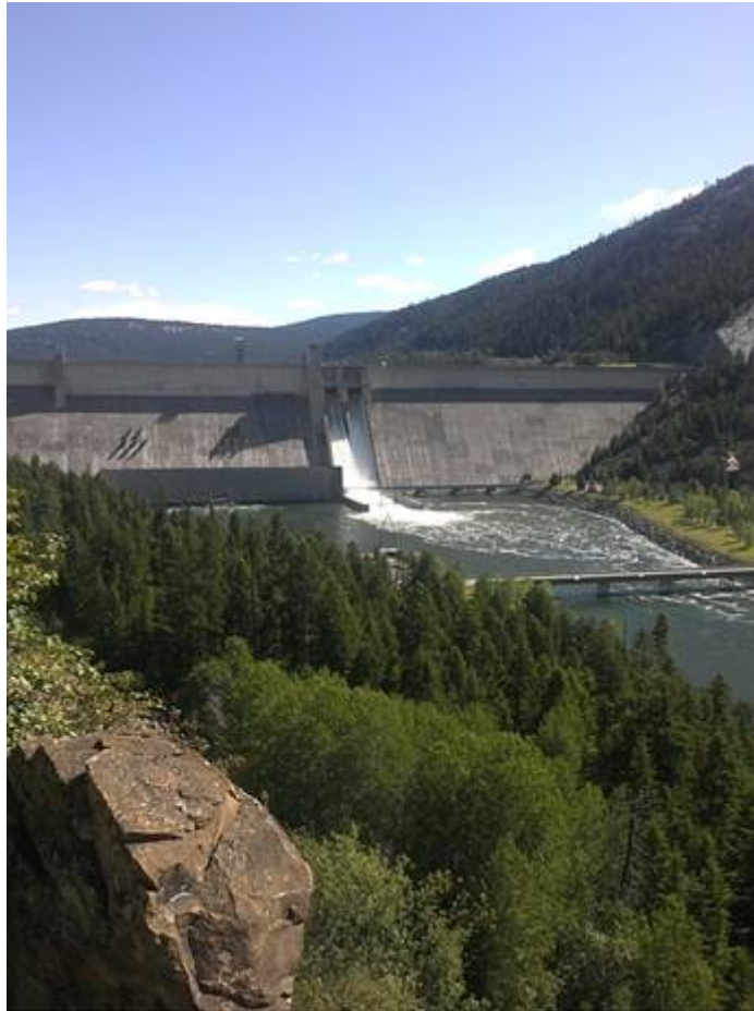
Libby Dam Libby, Montana

Bonneville Power Administration U.S. Bureau of Reclamation U.S. Army Corps of Engineers