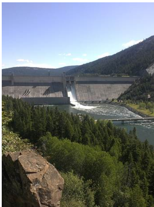
Libby Dam Libby, Montana

Bonneville Power Administration U.S. Bureau of Reclamation U.S. Army Corps of Engineers