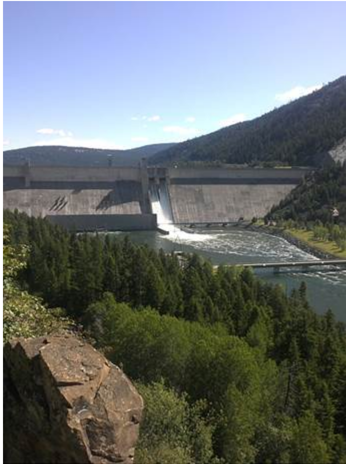
Libby Dam Libby, Montana

Bonneville Power Administration U.S. Bureau of Reclamation U.S. Army Corps of Engineers