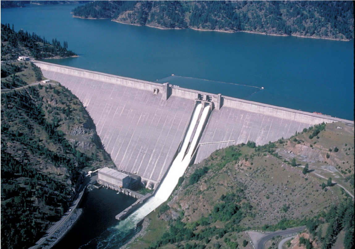
Dworshak Dam Ahsahka, Idaho

Bonneville Power Administration U.S. Bureau of Reclamation U.S. Army Corps of Engineers