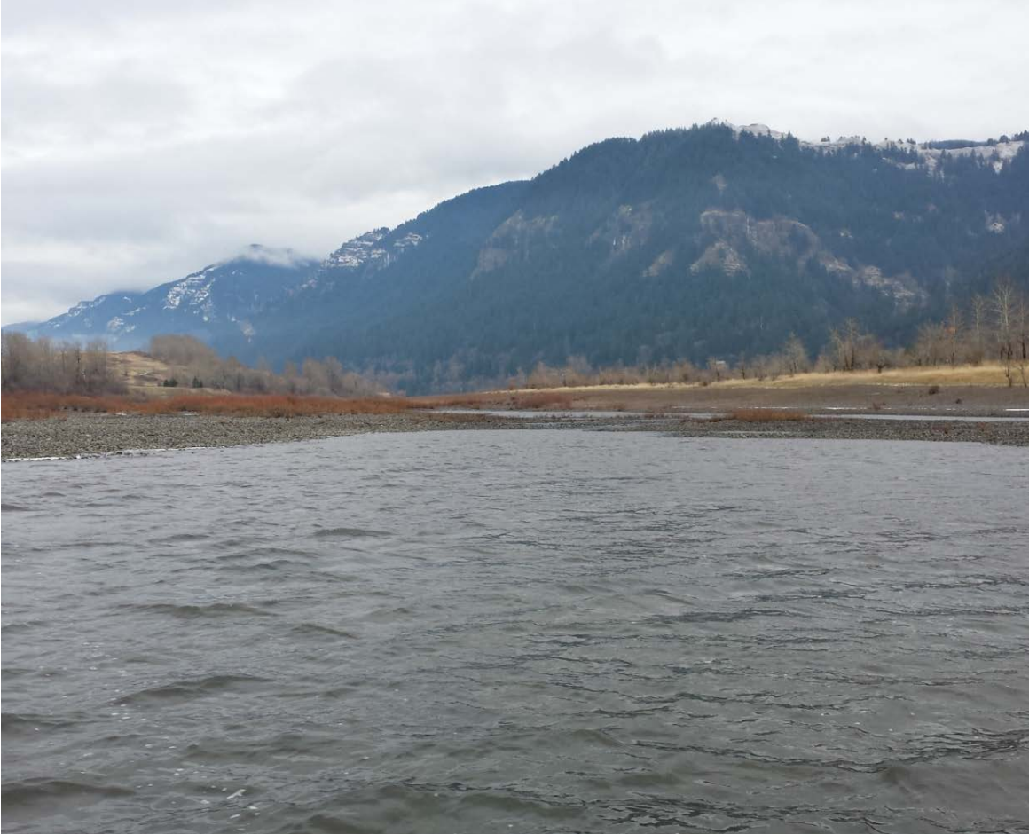
Ives Island Chum Spawning at 13' Tailwater Elevation, December 10, 2013.