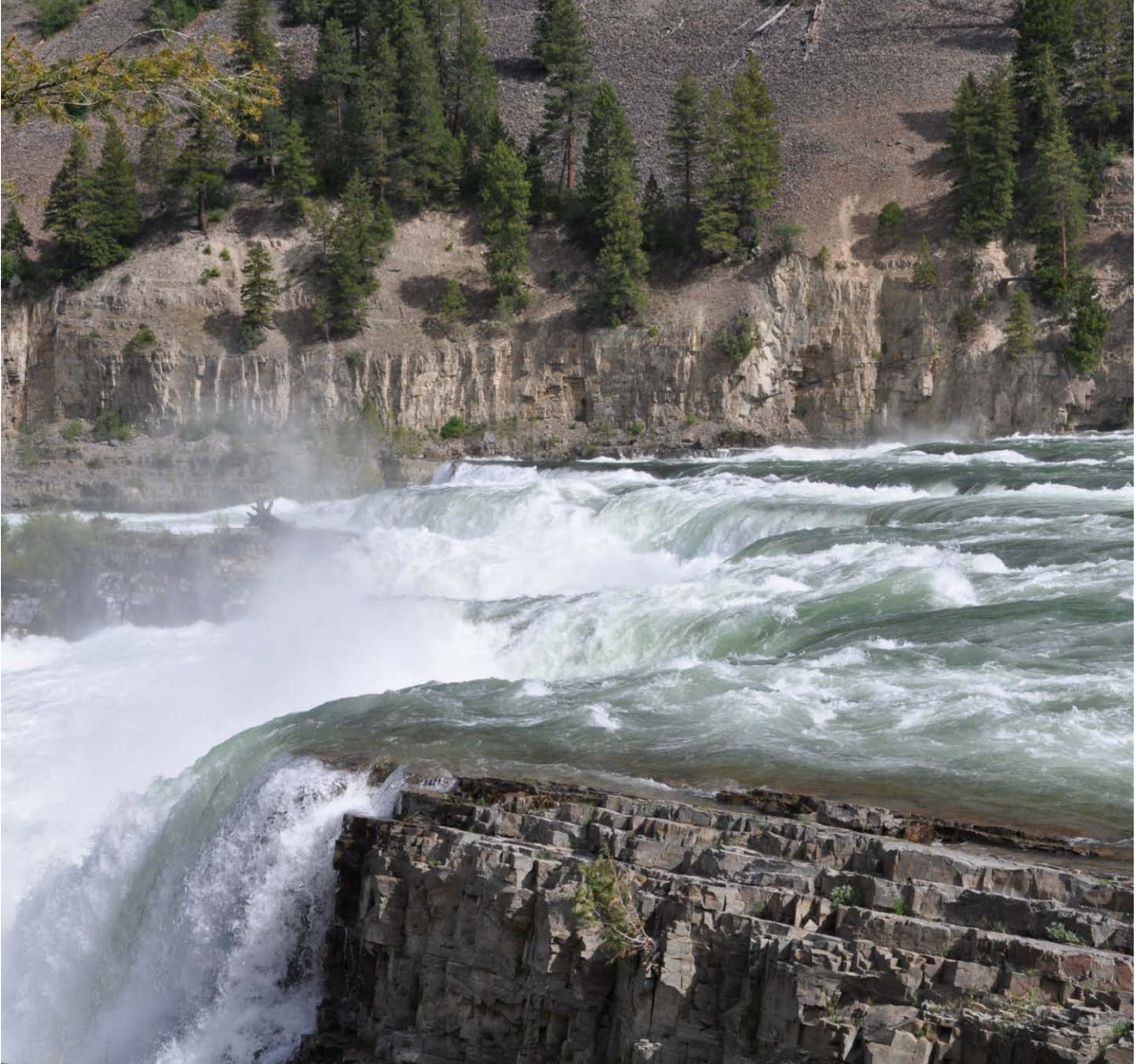
Kootenai Falls May 21, 2013 ~30 kcfs