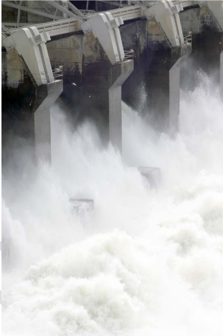
John Day Dam

Bonneville Power Administration U.S. Bureau of Reclamation U.S. Army Corps of Engineers