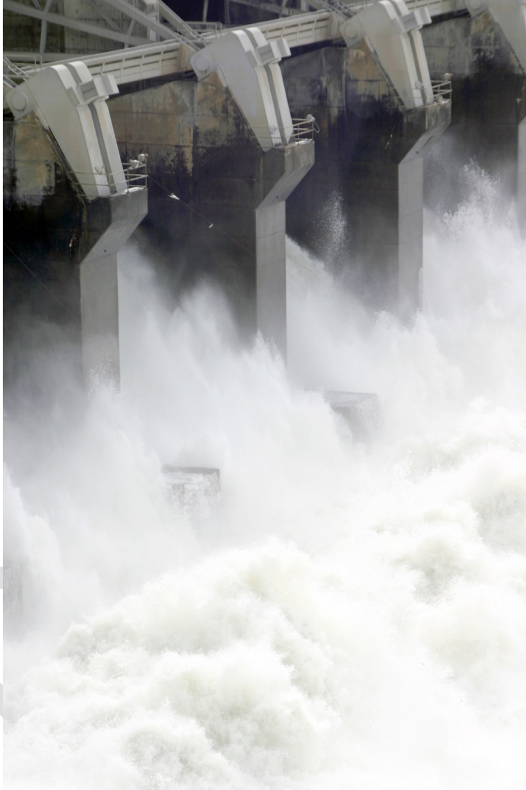
John Day Dam

Bonneville Power Administration U.S. Bureau of Reclamation U.S. Army Corps of Engineers