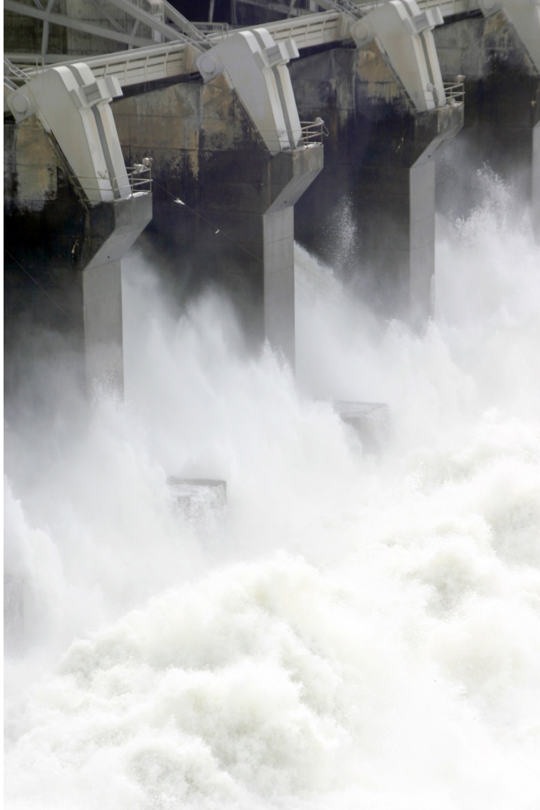
John Day Dam

Bonneville Power Administration U.S. Bureau of Reclamation U.S. Army Corps of Engineers