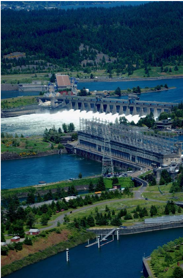
Bonneville Dam

Bonneville Power Administration U.S. Bureau of Reclamation U.S. Army Corps of Engineers