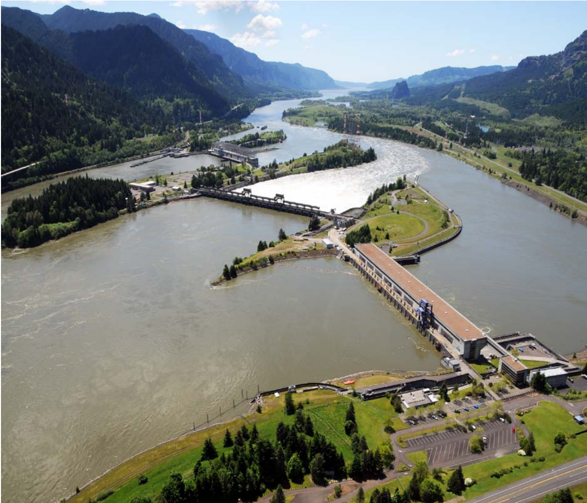
Bonneville Dam

Bonneville Power Administration U.S. Bureau of Reclamation U.S. Army Corps of Engineers