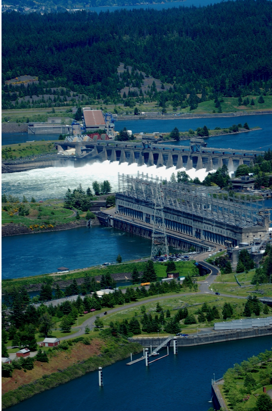
Bonneville Dam

Bonneville Power Administration U.S. Bureau of Reclamation U.S. Army Corps of Engineers