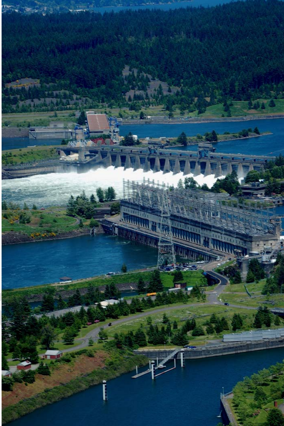
Bonneville Dam

Bonneville Power Administration U.S. Bureau of Reclamation U.S. Army Corps of Engineers