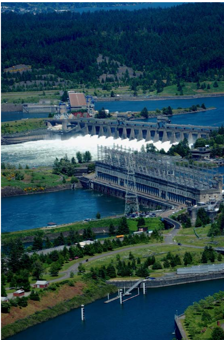
Bonneville Dam

Bonneville Power Administration U.S. Bureau of Reclamation U.S. Army Corps of Engineers