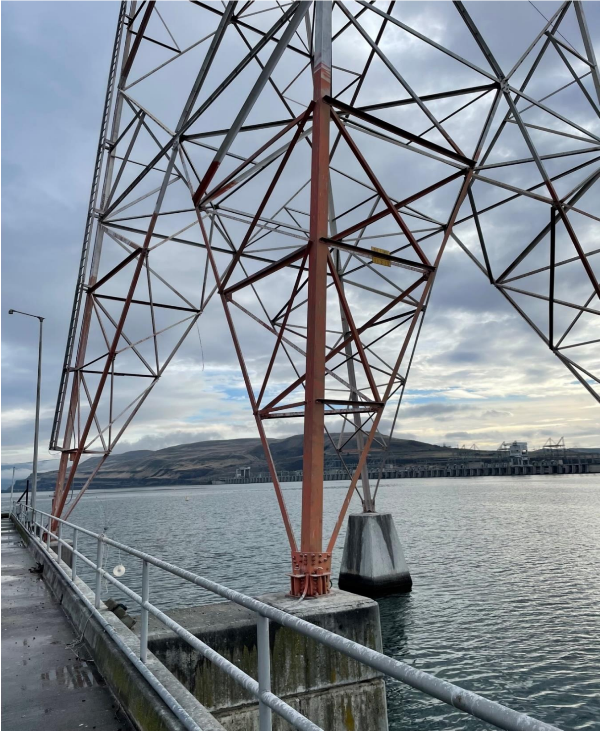
Gadfly noisemaker and dadi long legs, mounted at base of BPA tower to deter cormorant nesting.