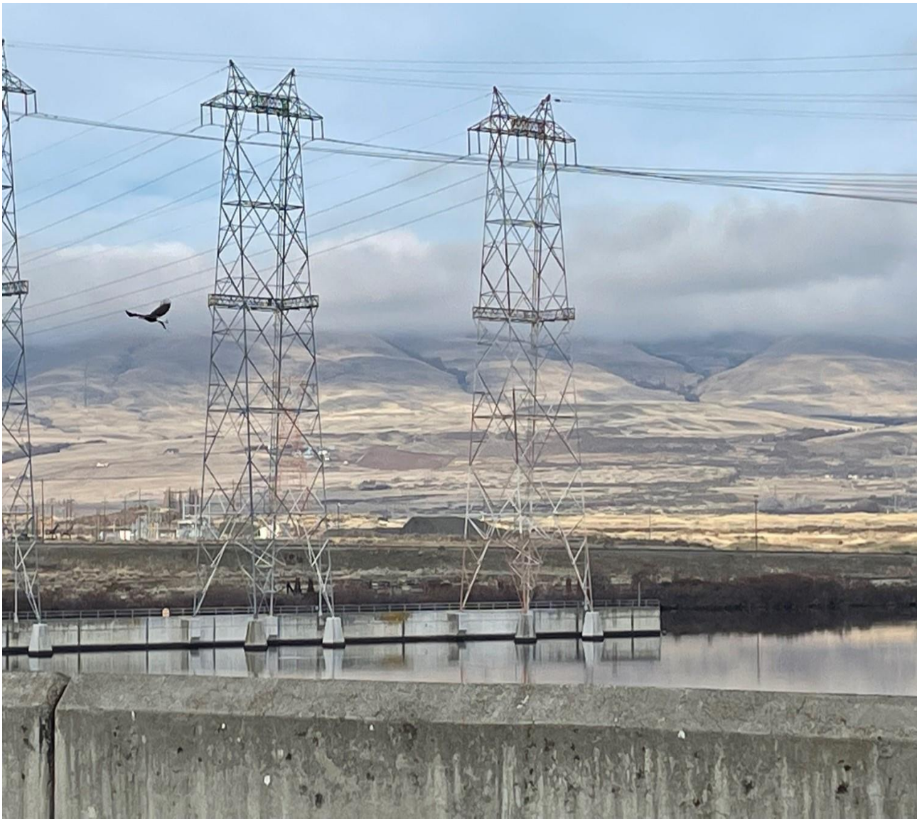
Bald eagles are here to feed on adult shad and keep other shad eaters away.