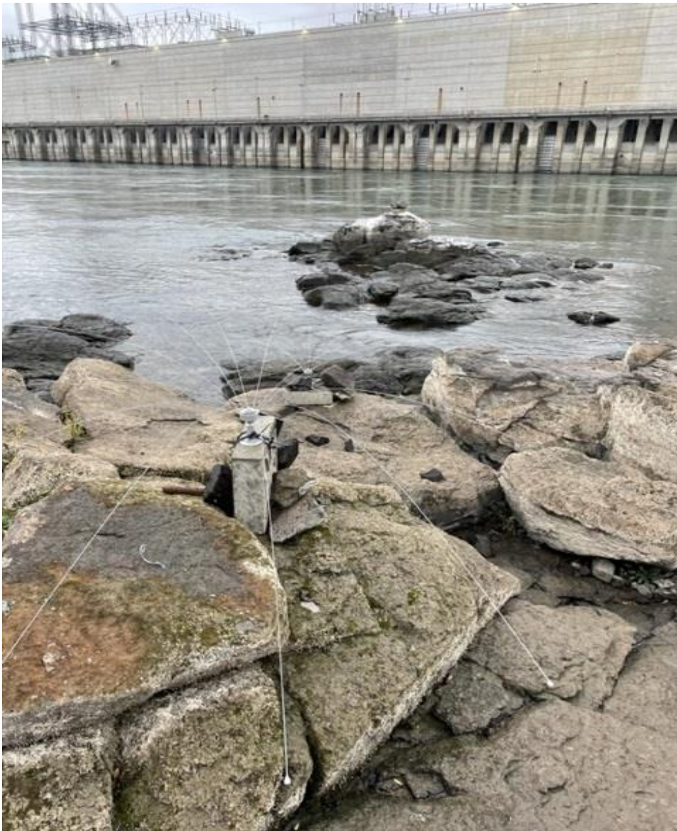
Daddi long legs seems to work deterring cormorants last few weeks. The solar recharge gadfly noisemaker out of battery.