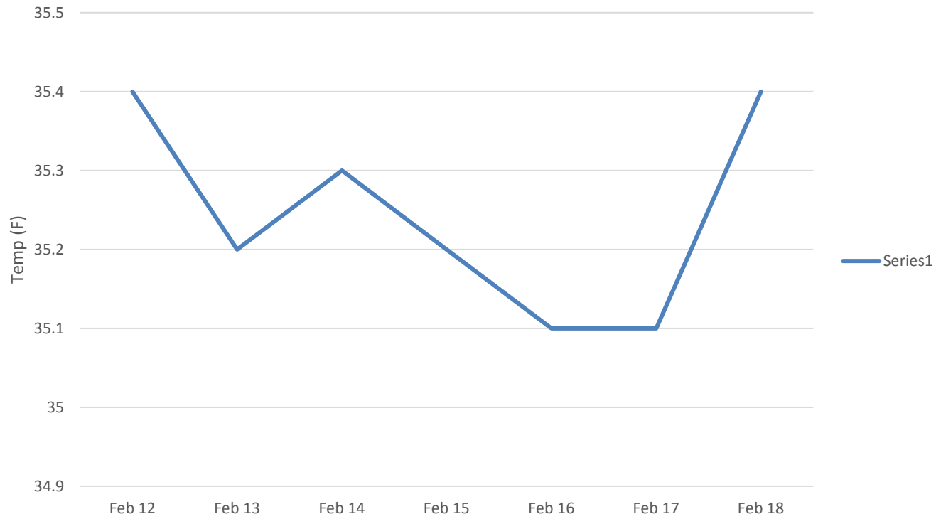
JDA Water Temperature