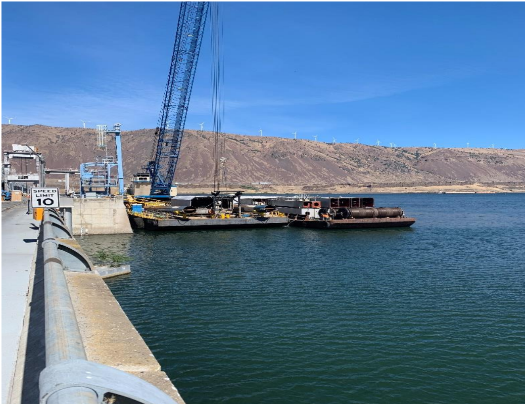
Intake crane loaded on barge to be recycled