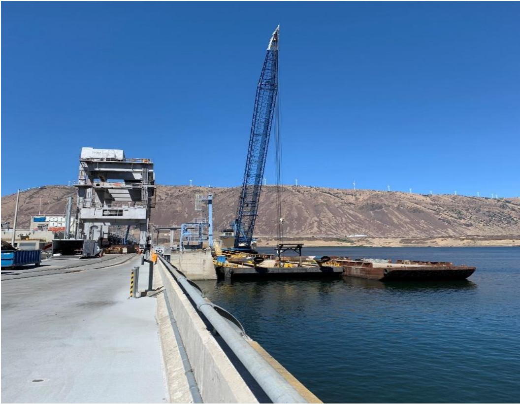
Intake crane demolition