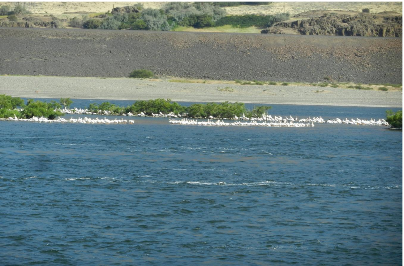
Pelicans on Preacher's Island