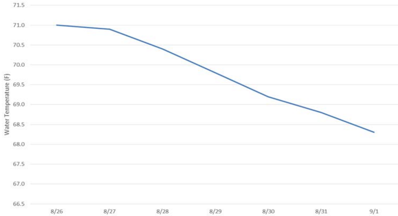
Water Temperature (8/26/18 - 9/1/18)