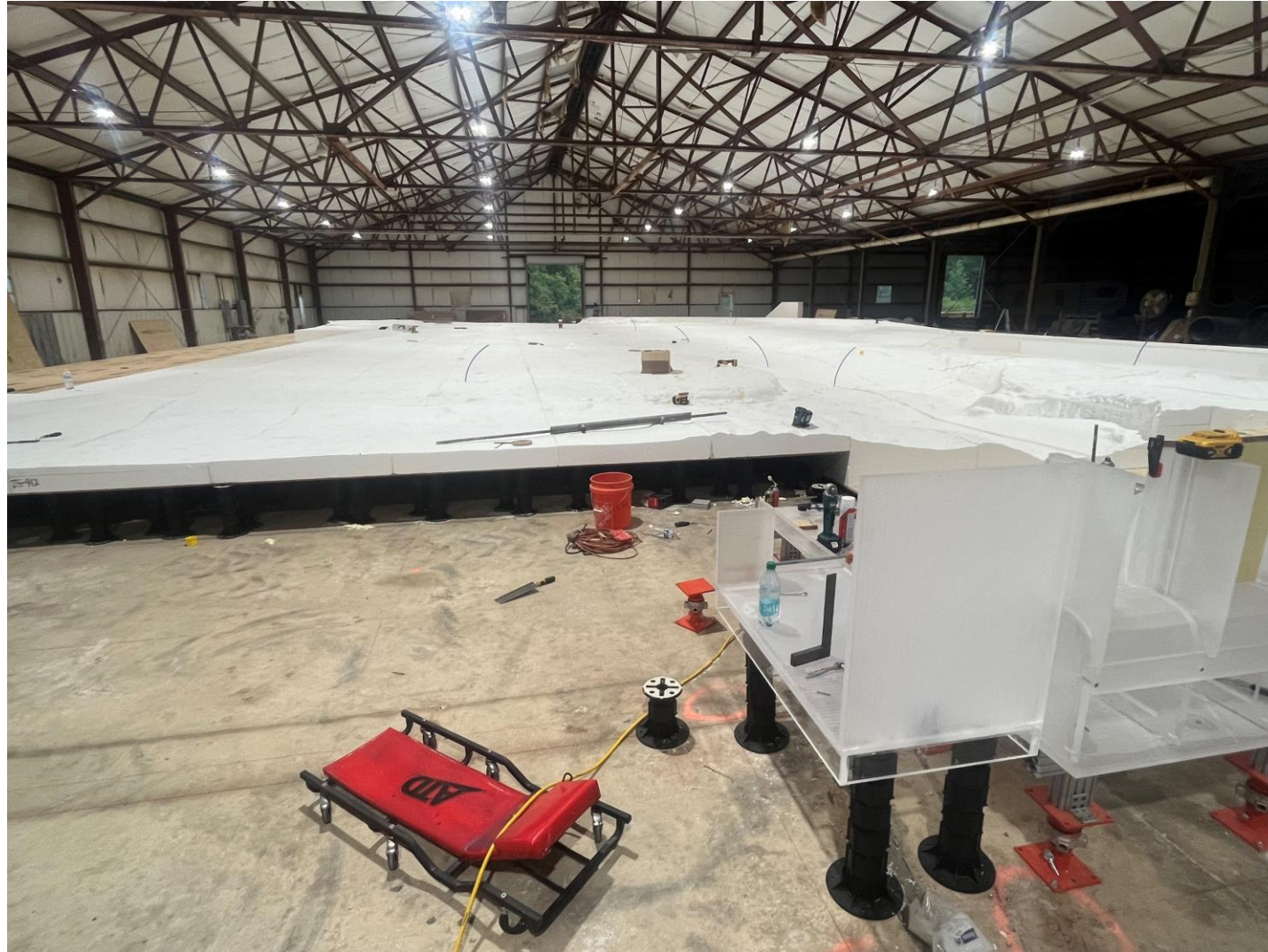
View of foam bathymetry from spillway