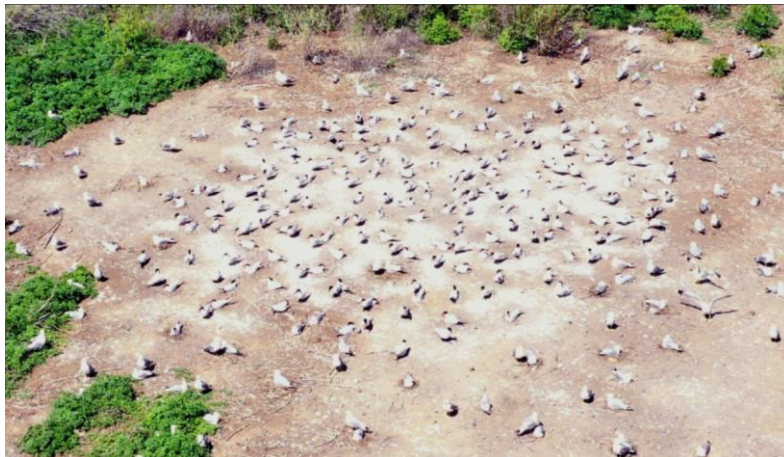
Figure 3. Preliminary imagery of the Caspian tern colony on Crescent Island on May 4, 2022.

A drone survey was conducted, and preliminary analysis confirmed a Caspian tern nesting colony at the historic colony site. A preliminary count of 178 Caspian terns were counted from drone imagery. While imagery is still being processed, the raw image is provided below (see Figure 3 ).