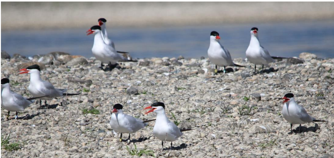
Figure 1. Banded Caspian terns on an unnamed island in Hanford Reach on May 3, 2022.

48 loafing Caspian terns were observed. Several terns were observed scraping and engaging in other breeding behaviors (e.g. copulation). We resighted 7 Caspian terns that were originally banded at sites in Potholes Reservoir: 1) 1 was banded as a chick in 2001 at Solstice Island; 2) 1 was banded as a chick in 2007 at Goose Island; 3) 2 were banded as chicks in 2009 at Goose Island; 4) 2 were banded as adults in 2011 at Goose Island; and 5) 1 was banded as a chick in 2011 at Goose Island (see Figure 1 ).