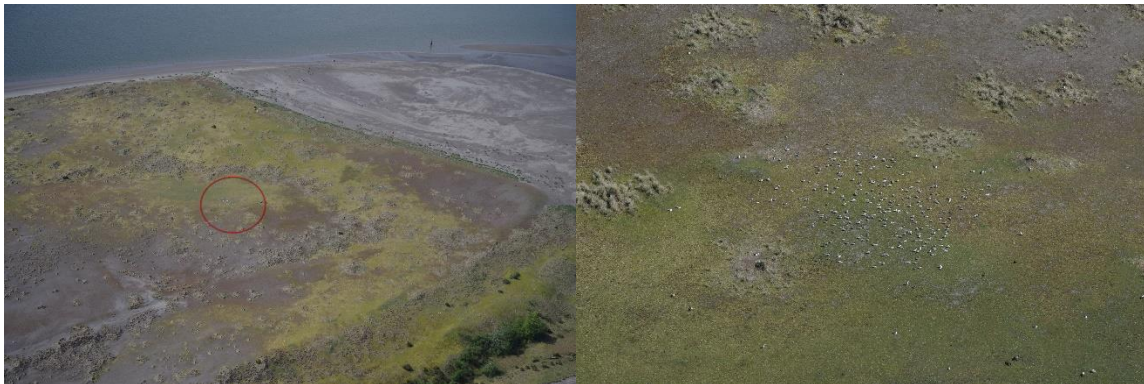
Figure 4. Caspian terns nesting on the interior of Rice Island, as seen from an aerial survey on May 8, 2022.

Most aerial images are still being processed from our fixed-wing survey of the Columbia River estuary from East Sand Island to the transmission towers in Troutdale, OR. An initial analysis confirmed a Caspian tern colony on Rice Island where a preliminary count of ~270 individuals were observed (see Figure 4 ).