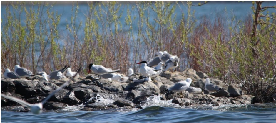
Figure 2. Loafing Caspian terns at East Rocks on Goose Island on May 3, 2022.

2 Nesting dissuasion activities occurred during counts.