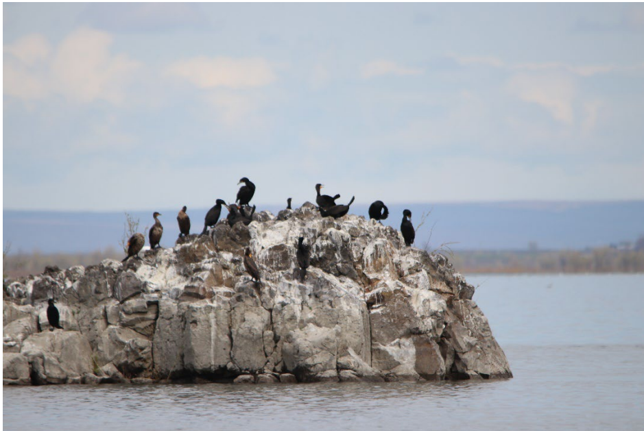
Figure 2. Double-crested cormorants observed on an outlying island at Goose Island in Potholes Reservoir on April 27, 2022.

20 loafing double-crested cormorants were observed on an outlying island to Goose Island (see Figure 2 ). No nesting was confirmed.