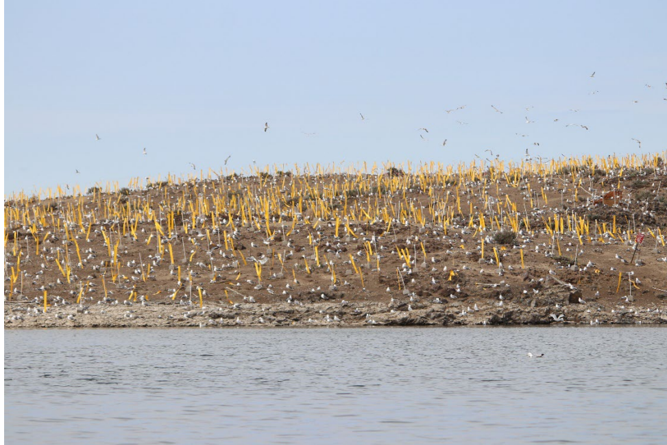
Figure 3: Gulls nesting amidst the dissuasion flagging at Goose Island on April 27, 2022.