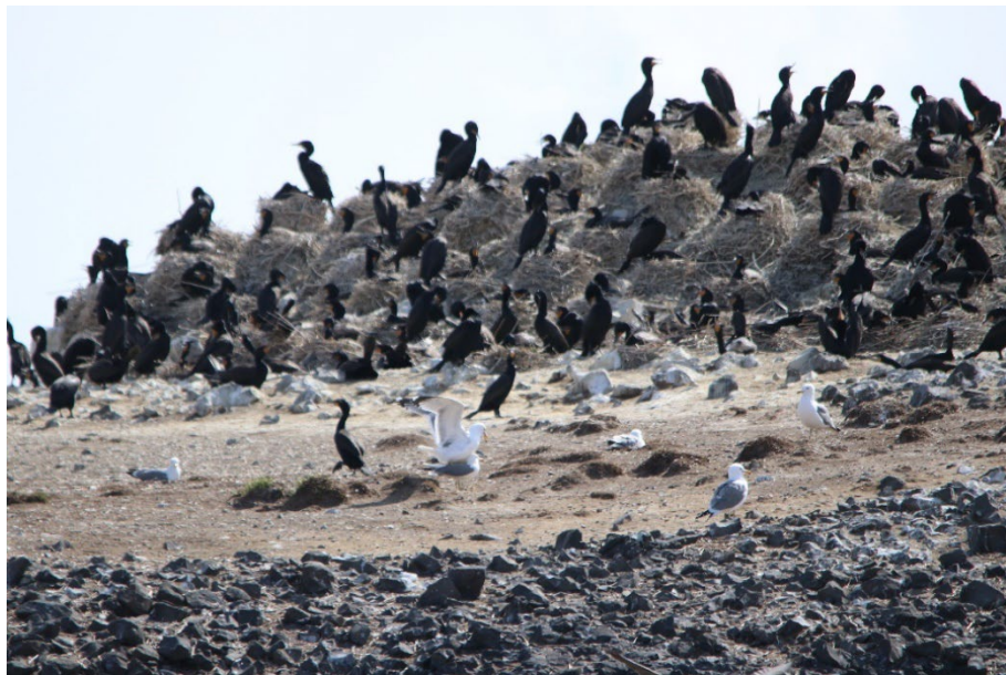
Figure 4: Double-crested cormorants and gulls on Harper Island on April 28, 2022.

~373 double-crested cormorants and ~100 attended nests were observed (See Figure 4 ).