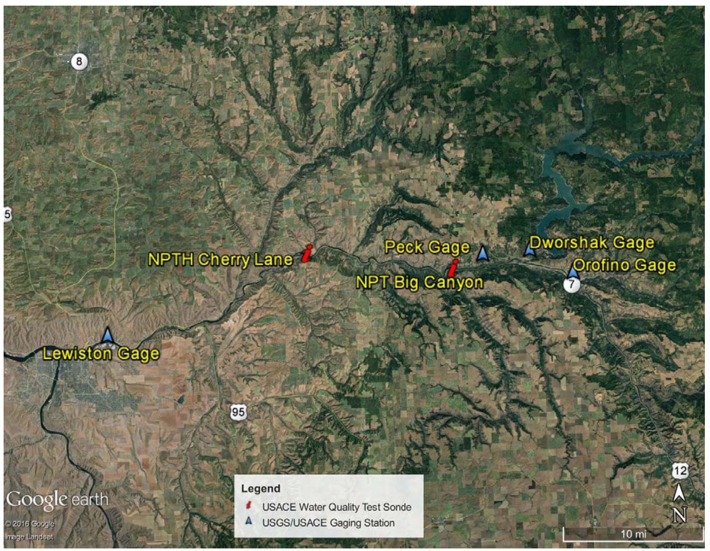
Permanent USGS/USACE River Gaging Stations and Water Quality Sonde Deployment Sites Used During the TDG Spill Test