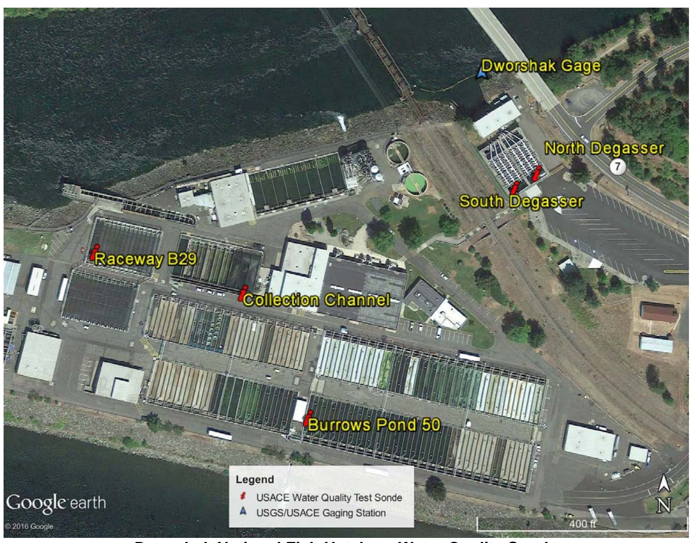
Dworshak National Fish Hatchery Water Quality Sonde Deployment Sites for TDG Spill Test